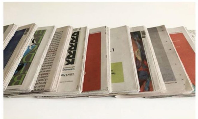
2023, n. 12 examples, each one 224p, 23 x 16 cm. Angelo Ricciardi, Italy. https://www.angeloricciardi.net